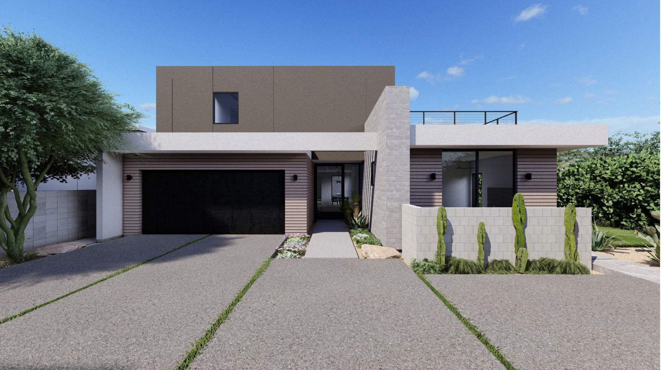
1832 - front elevation