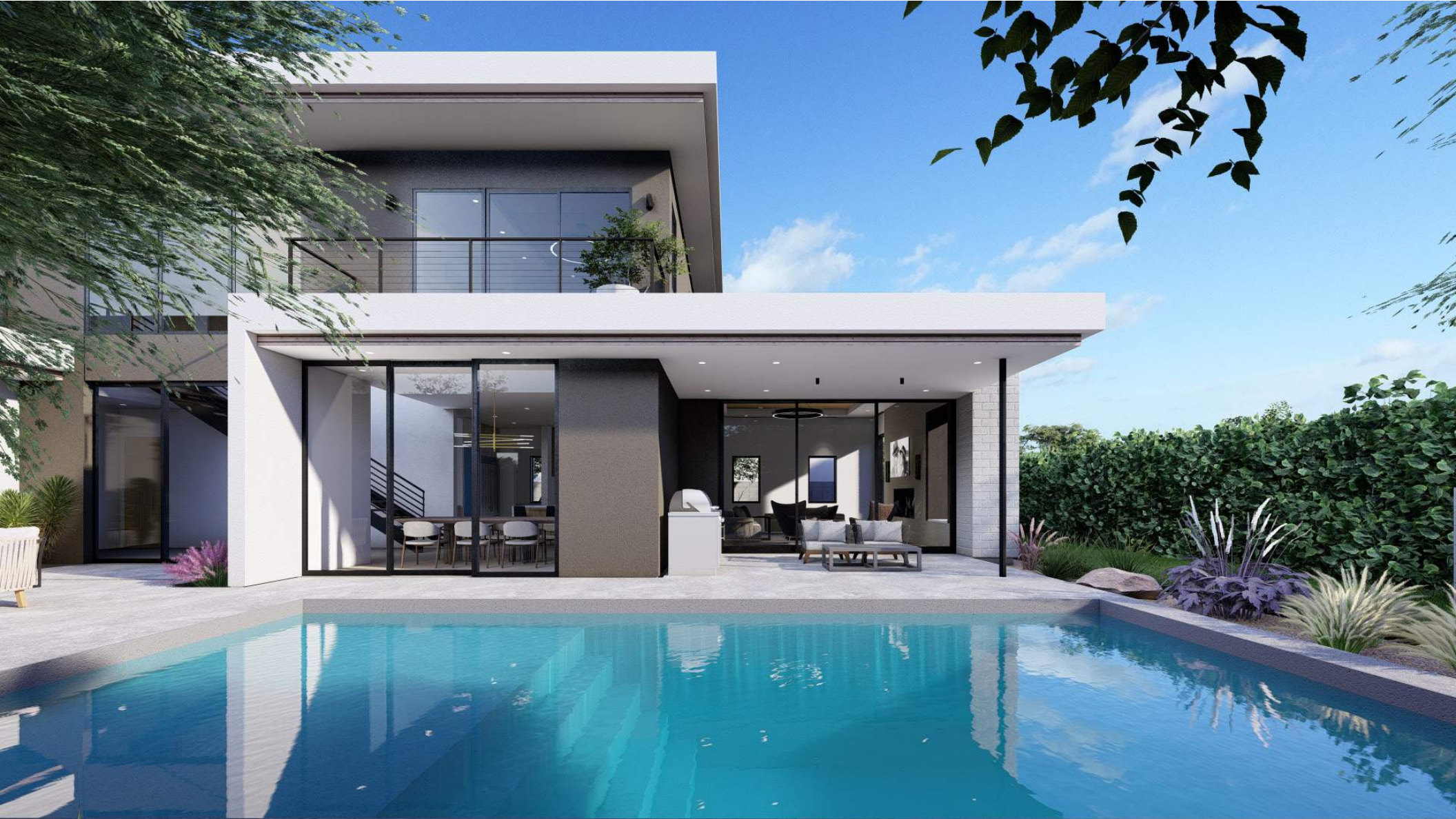
1830 - rear yard