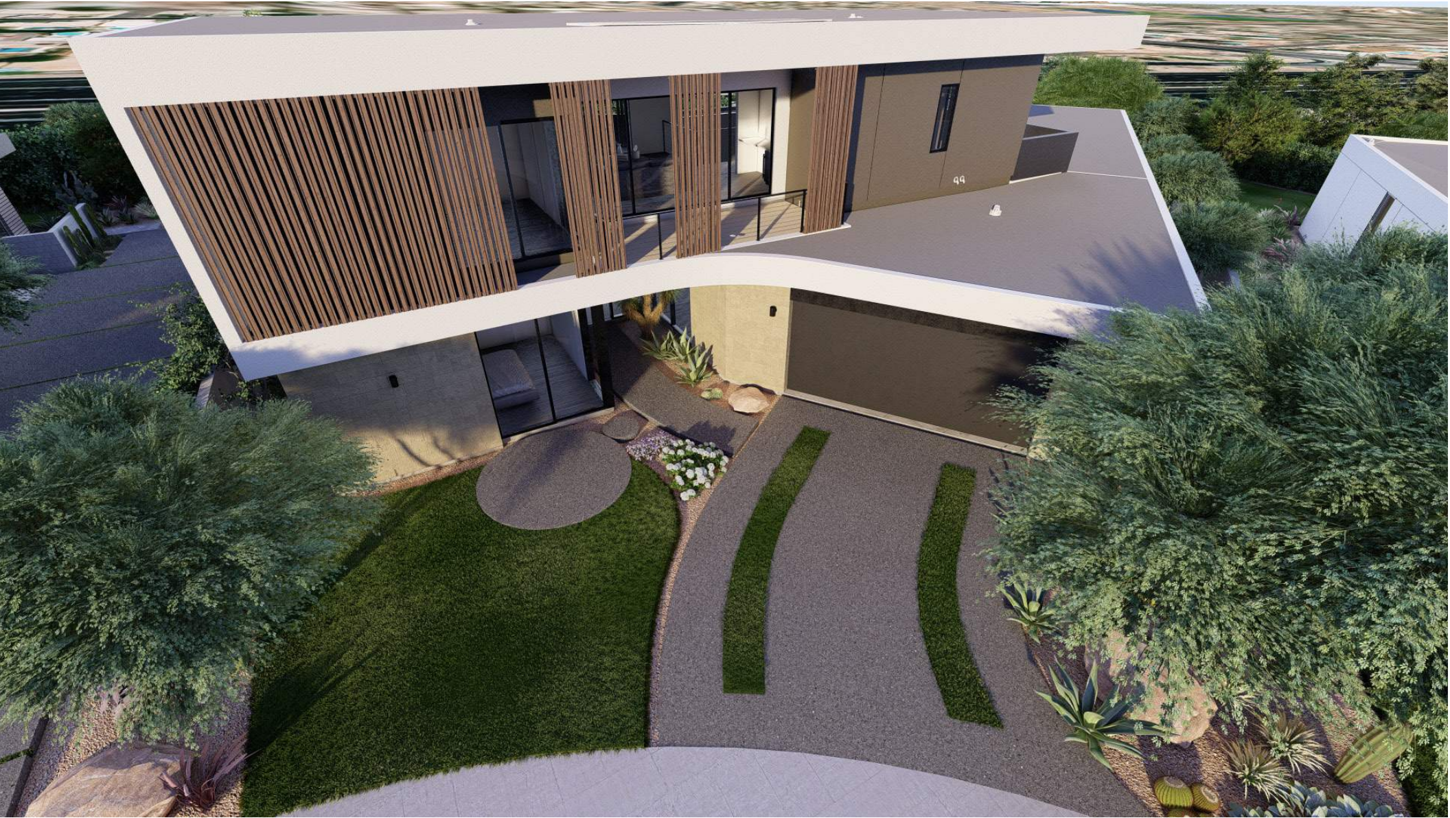
1831 - front yard