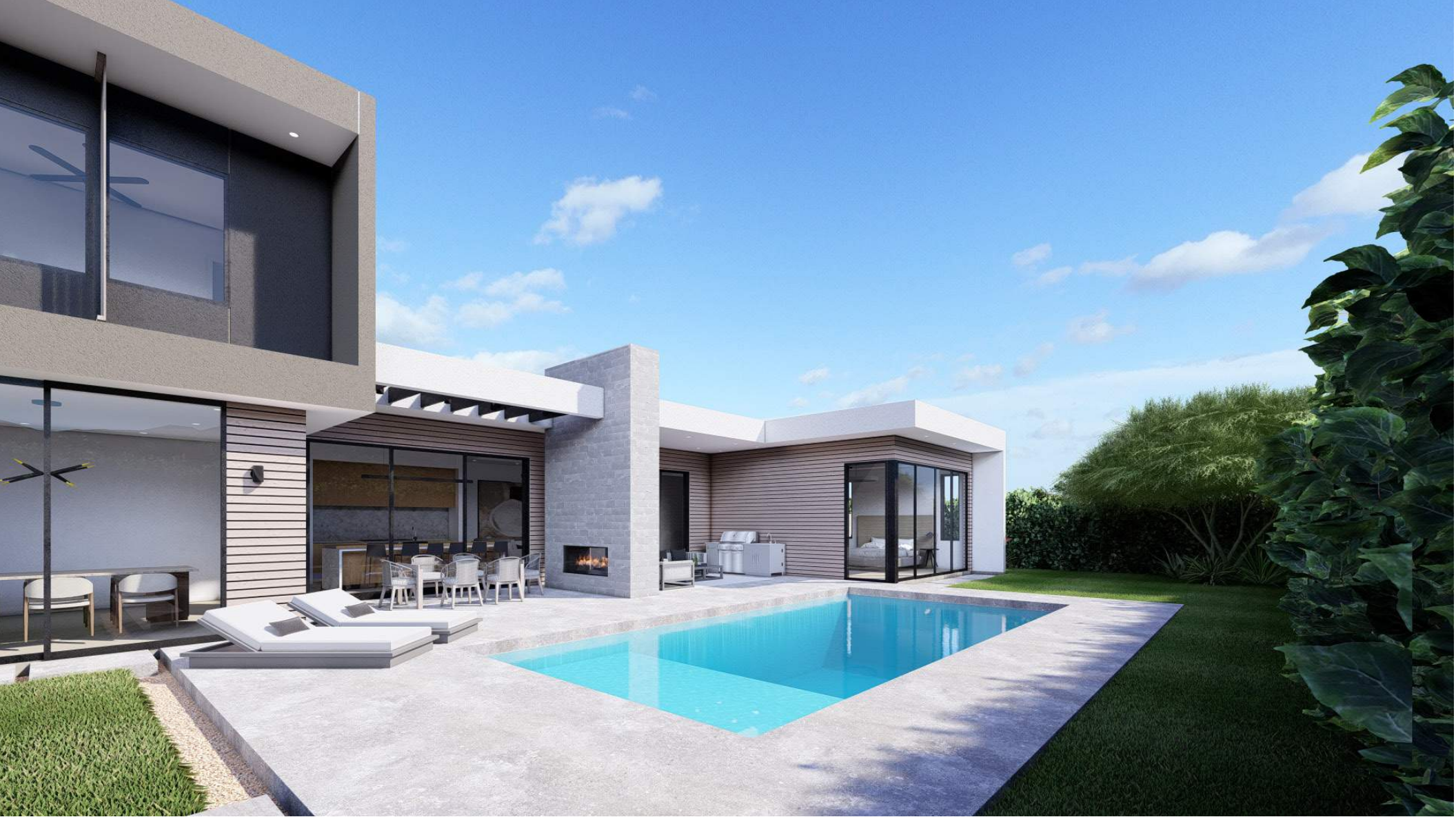
1832 - rear yard