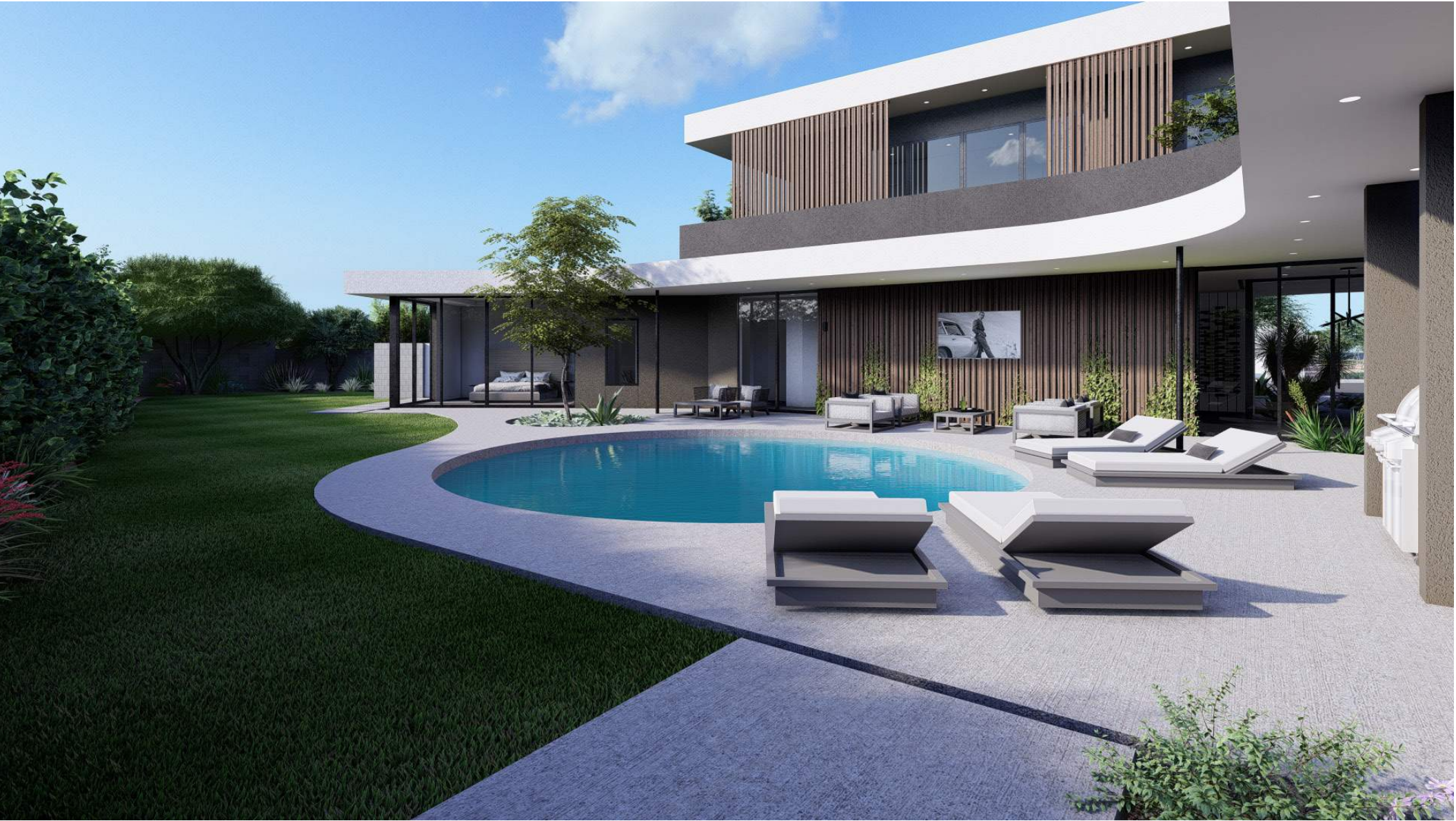
1831 - rear yard - south