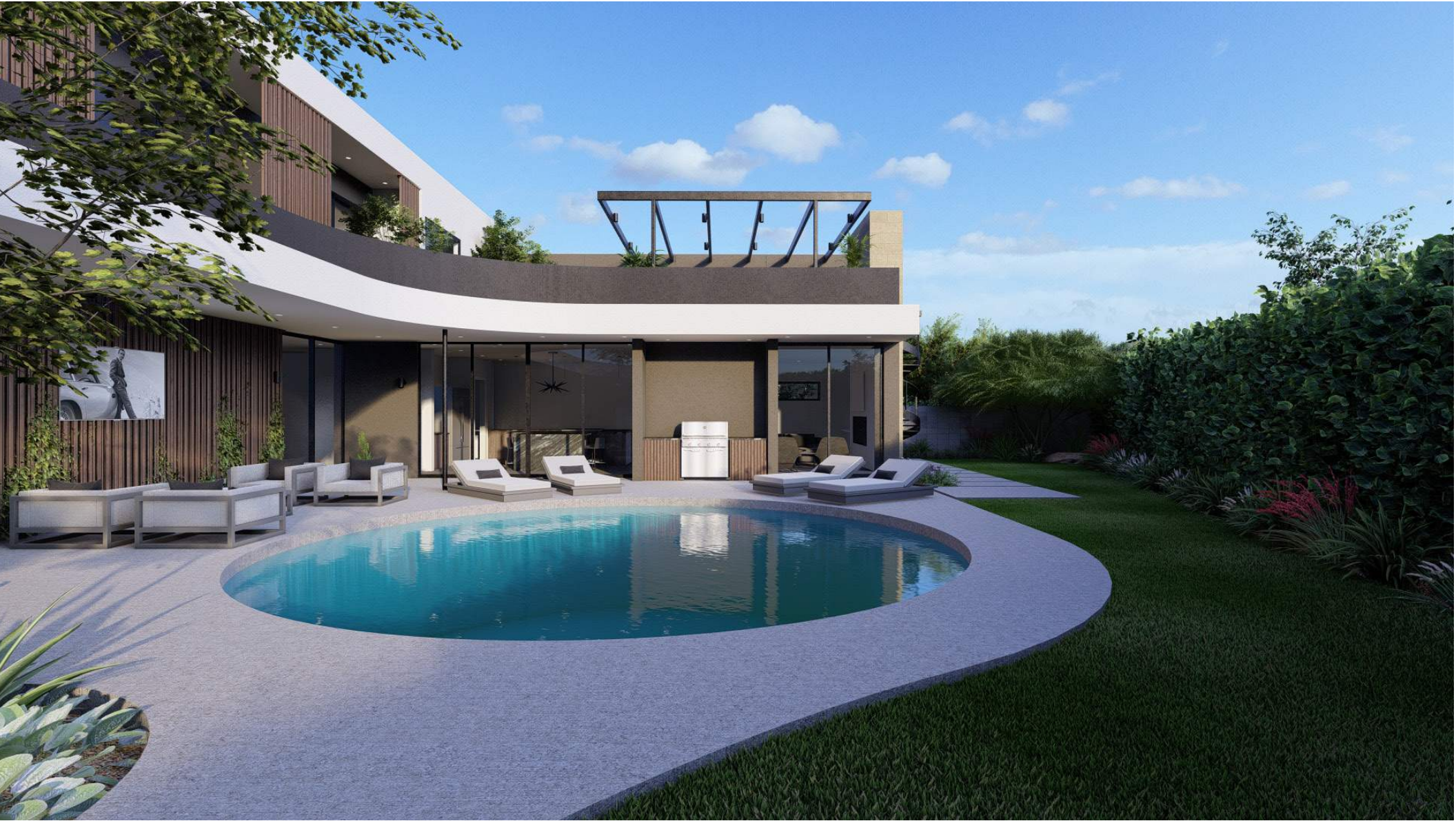
1831 - rear yard - north