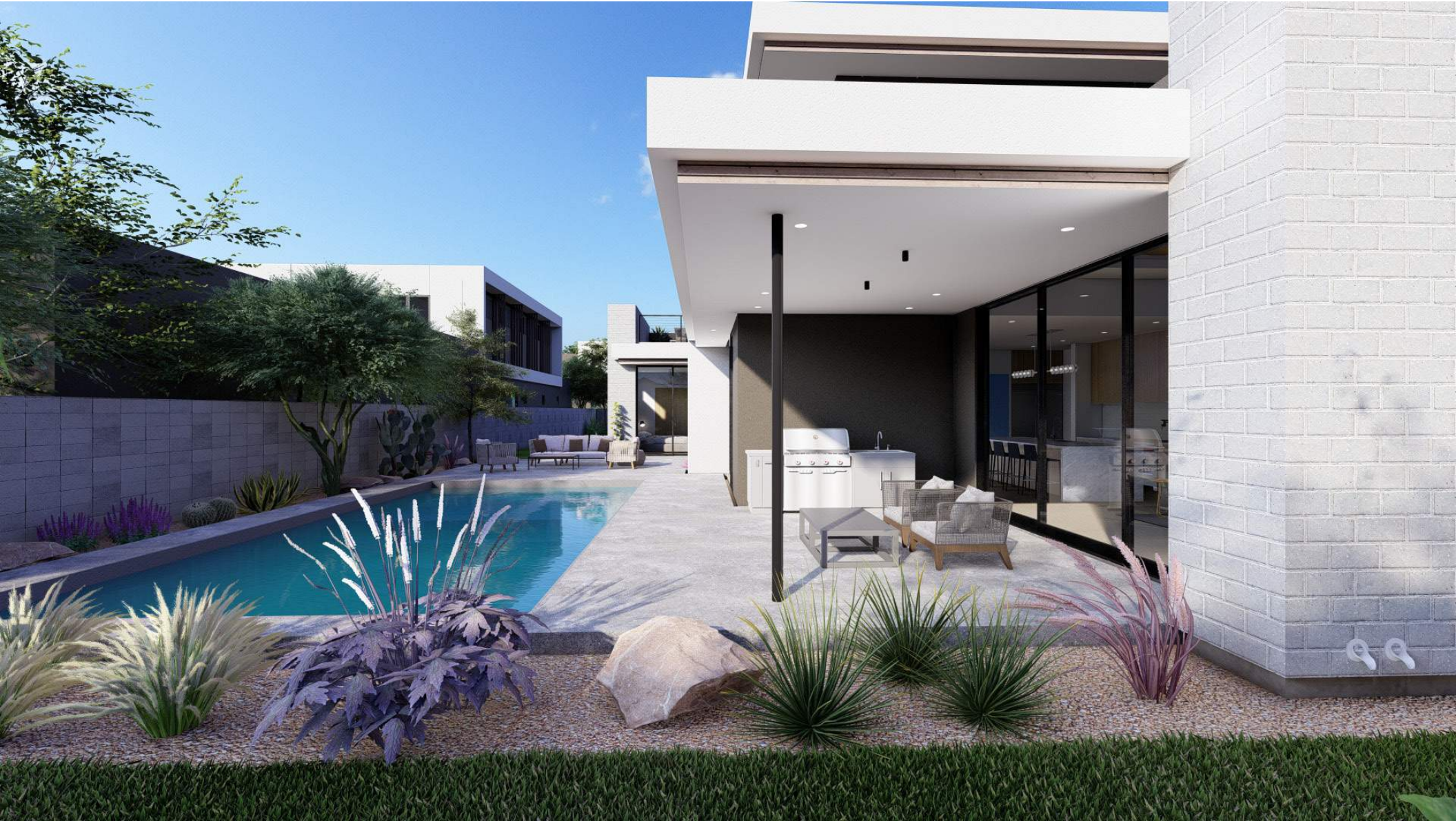
1830 - pool area