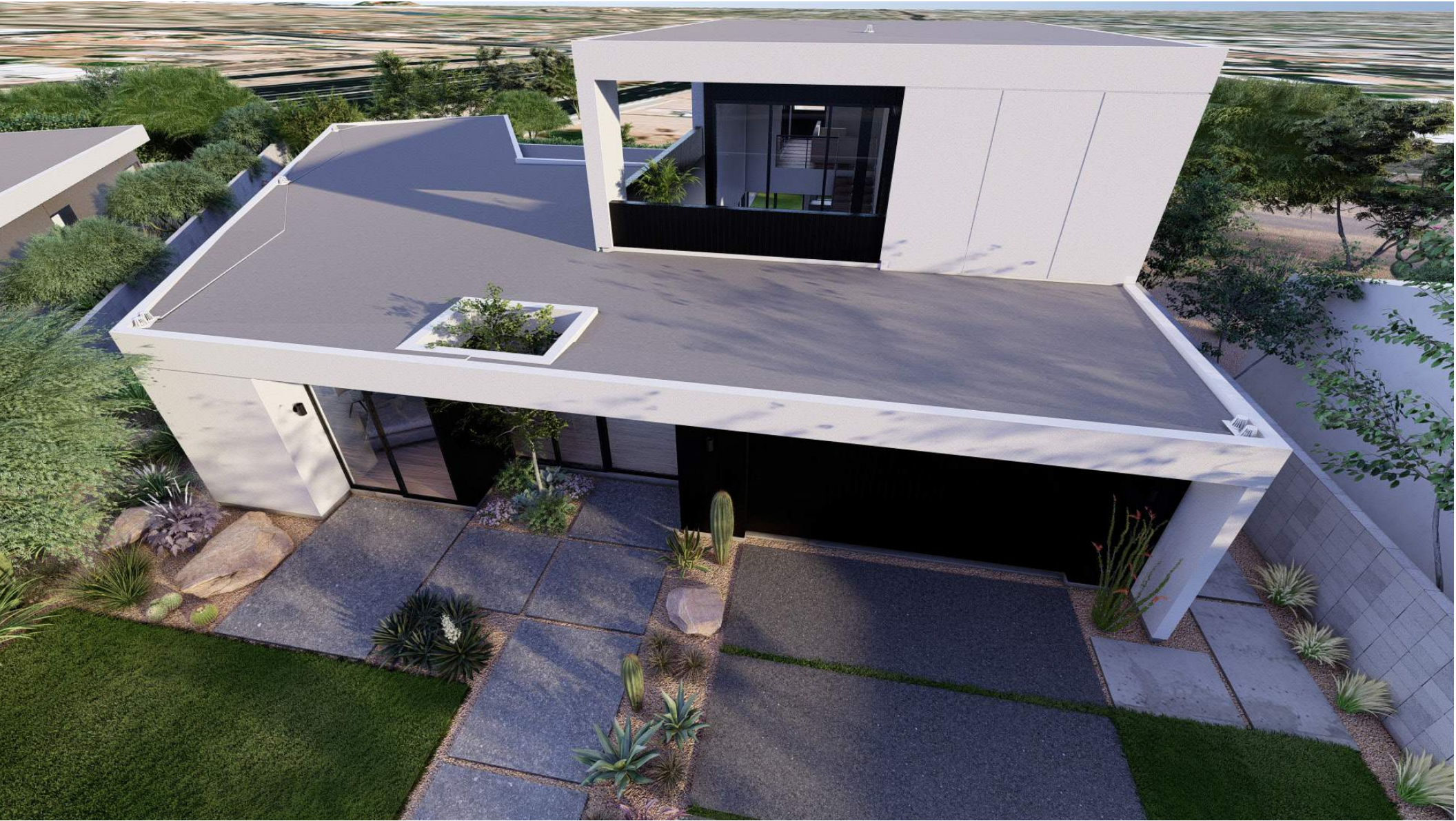
1827 - front aerial