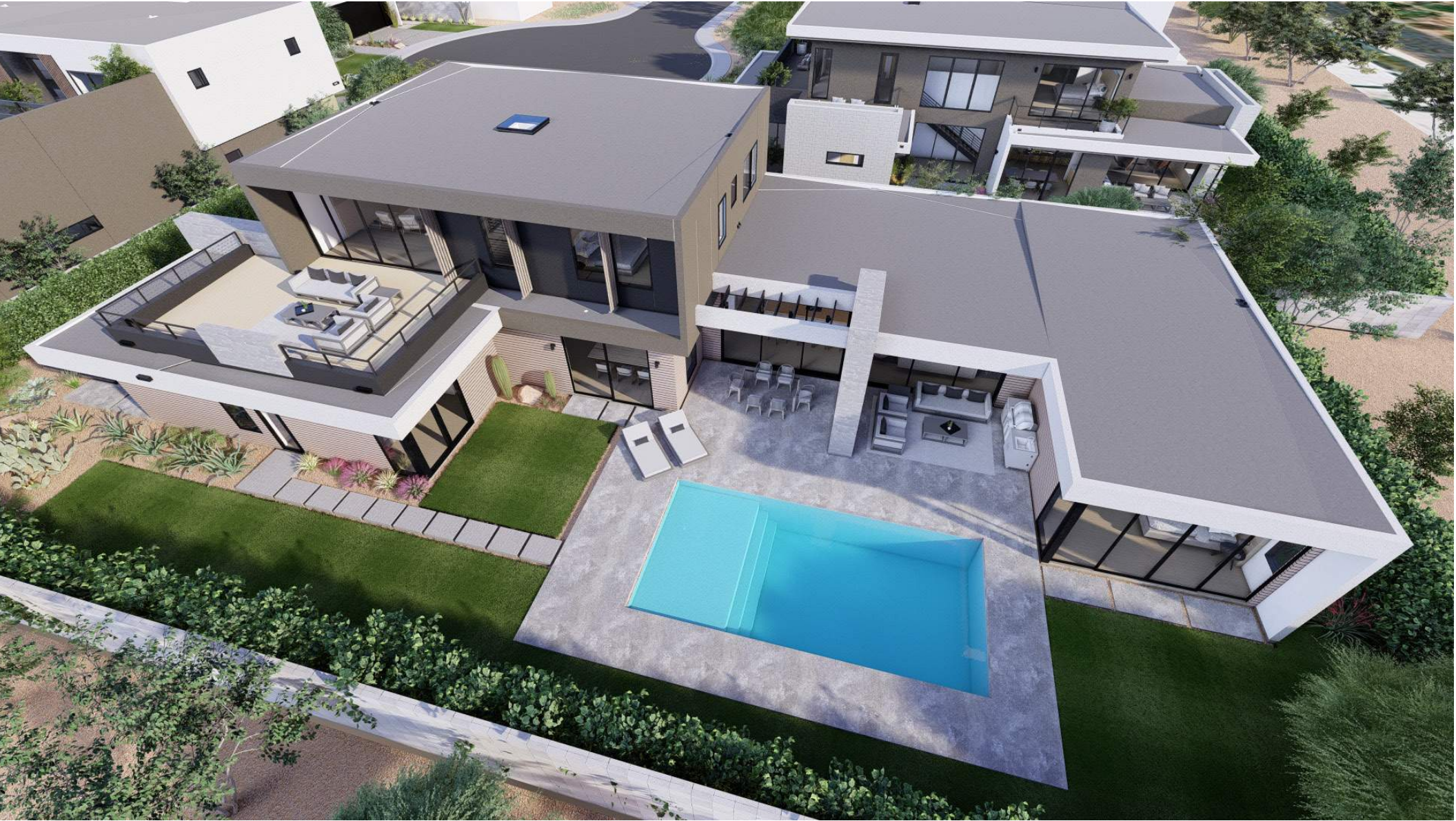
1832 - rear terrace