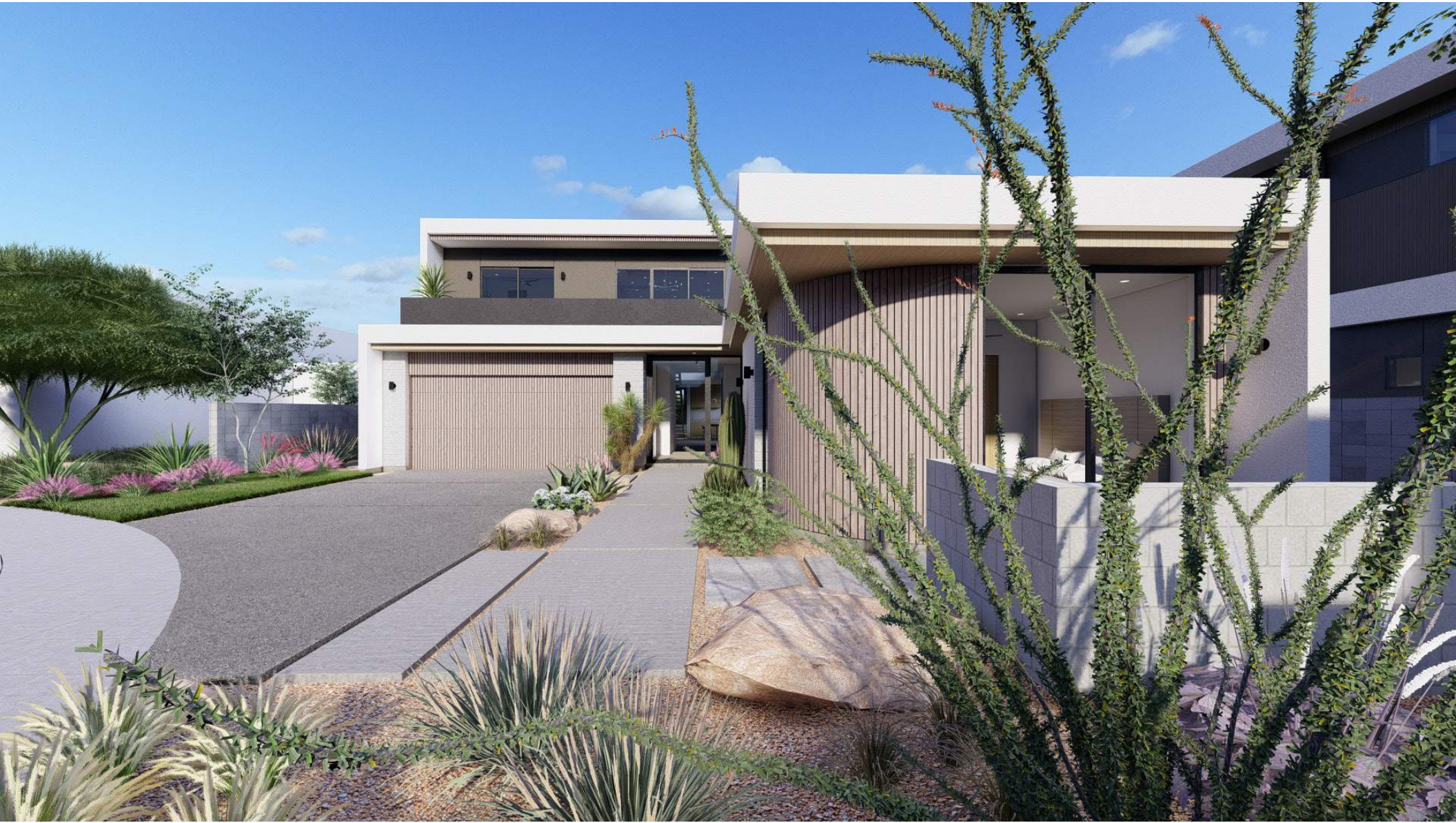
1830 - front