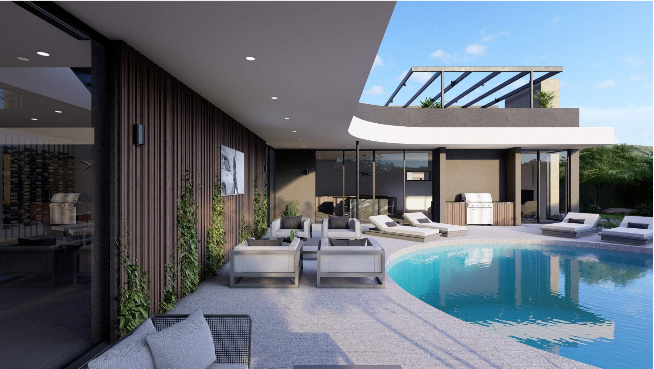
1831 - covered patio