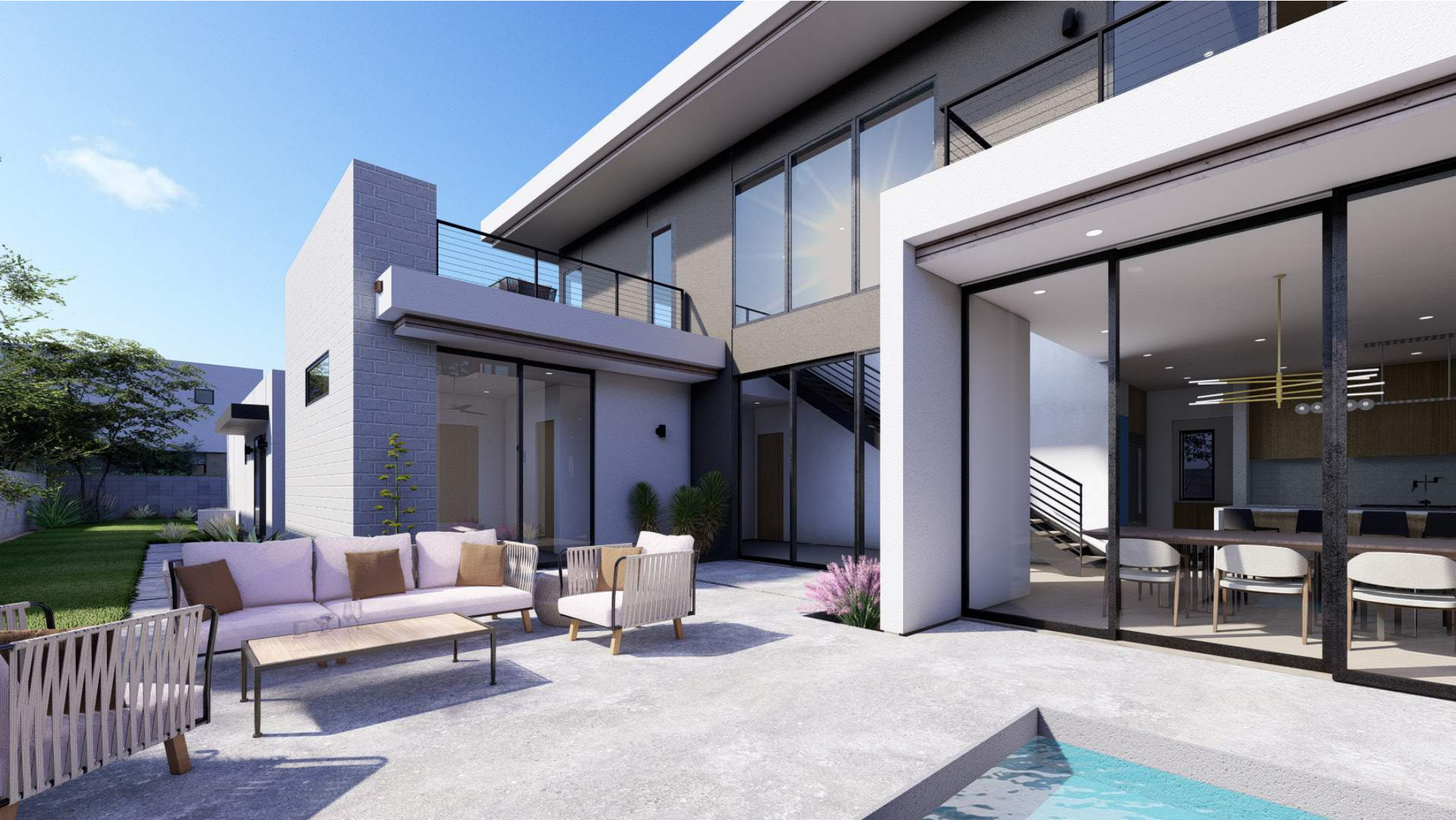
1830 - side yard