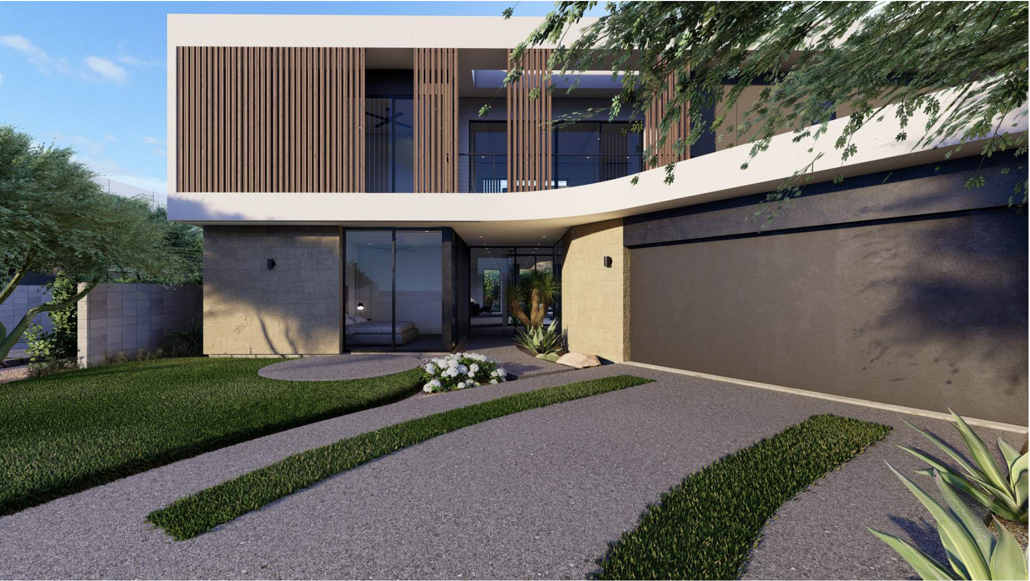
1831 - front entry