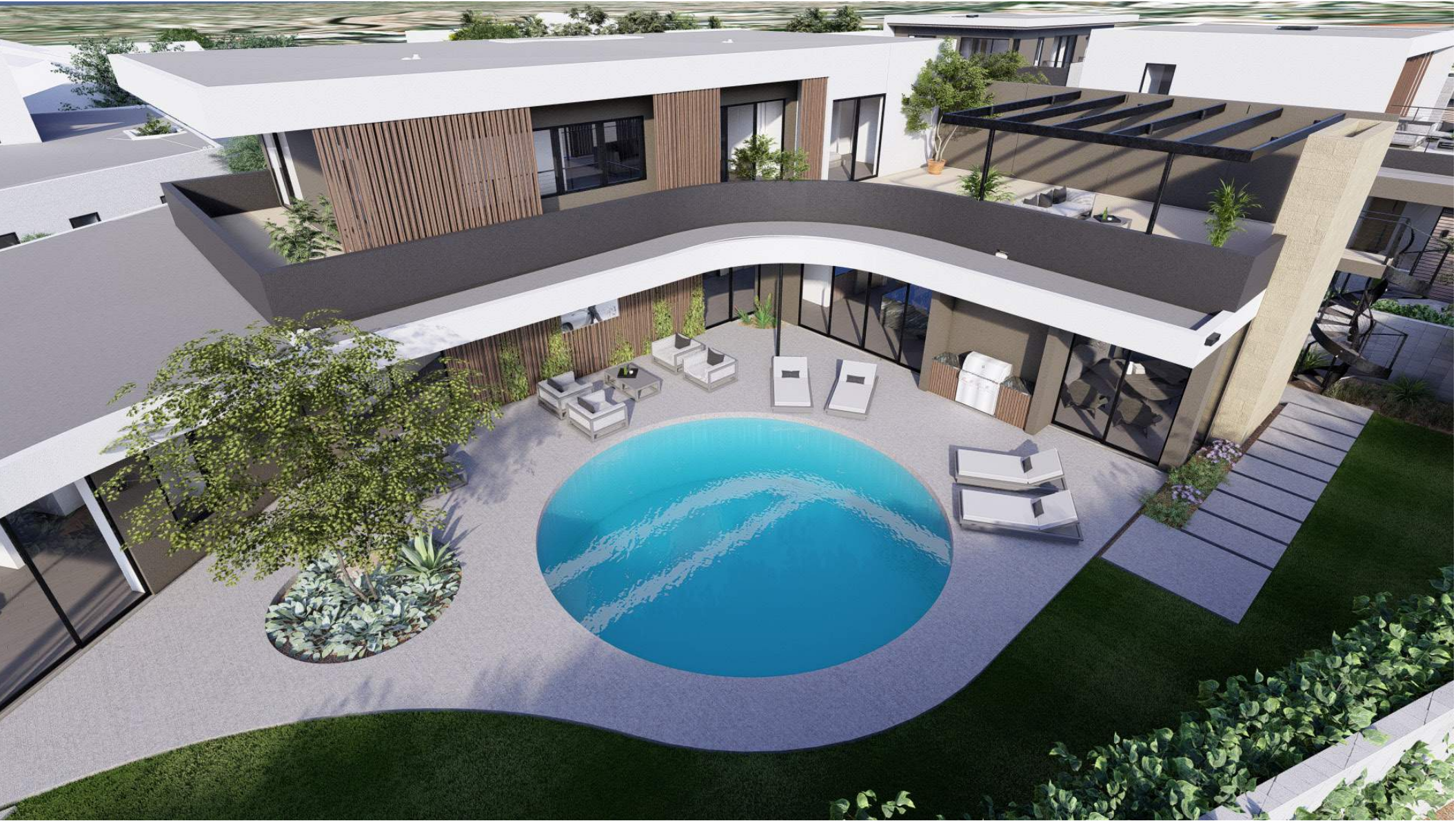
1831 - rear yard - aerial