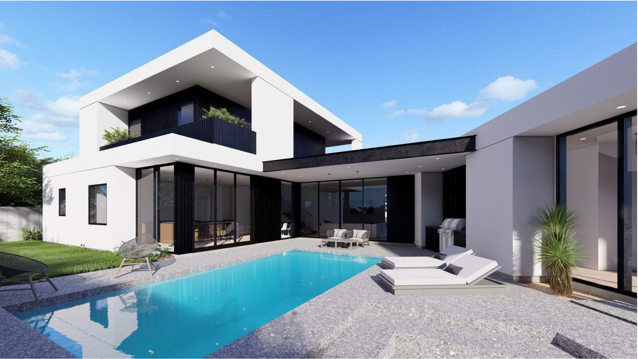
1827 - rear