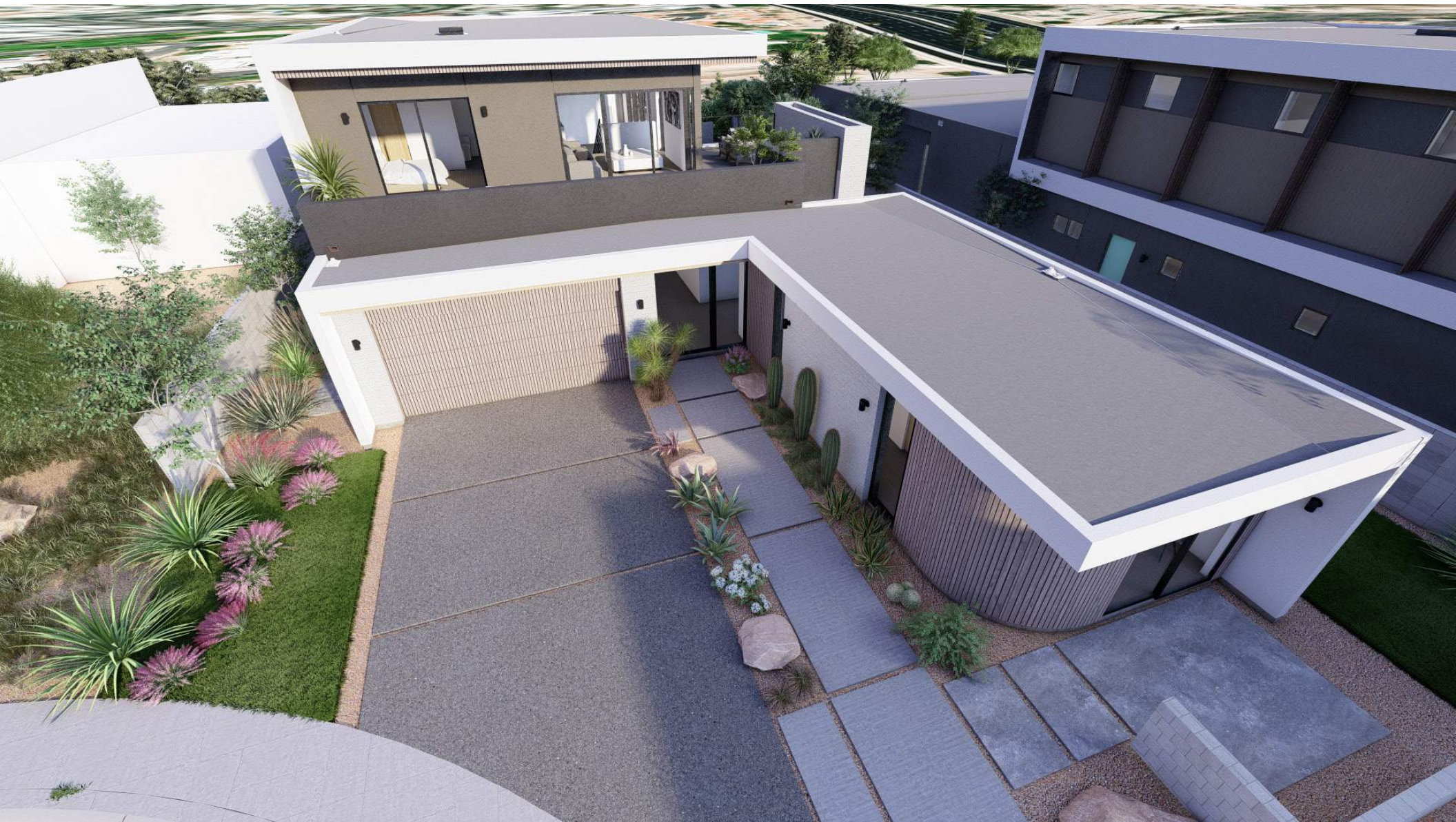
1830 - front aerial