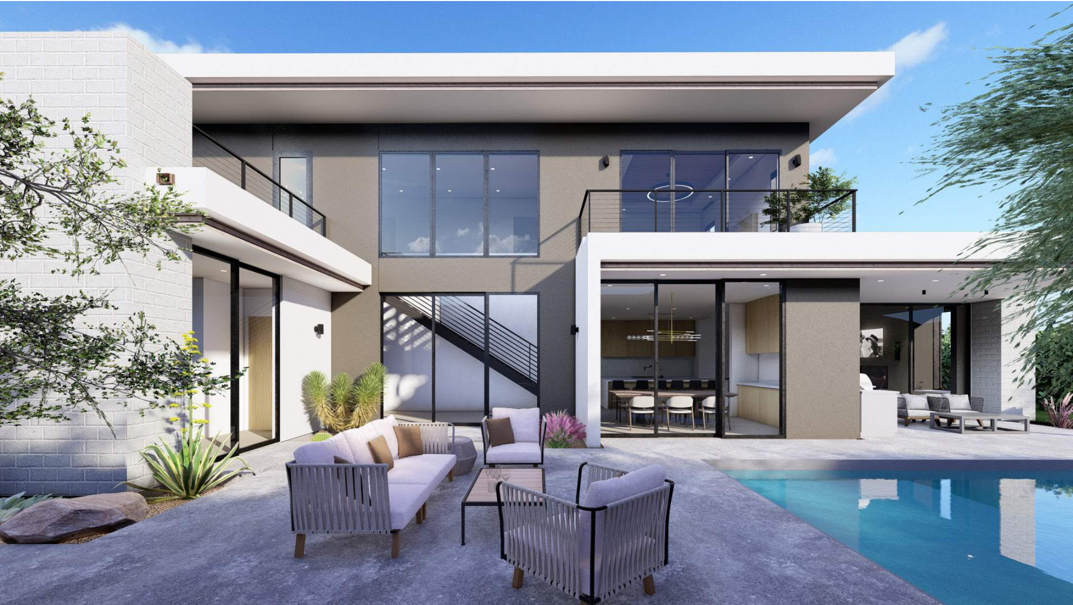
1830 - side yard - west