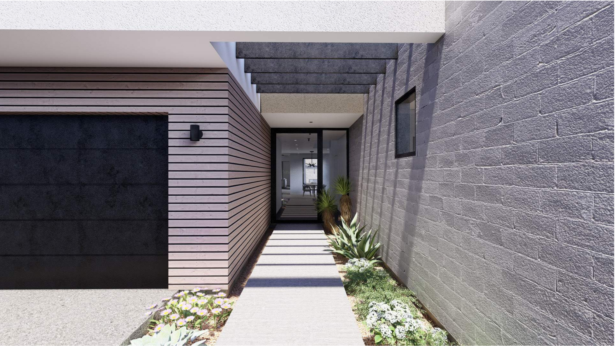
1832 - entry