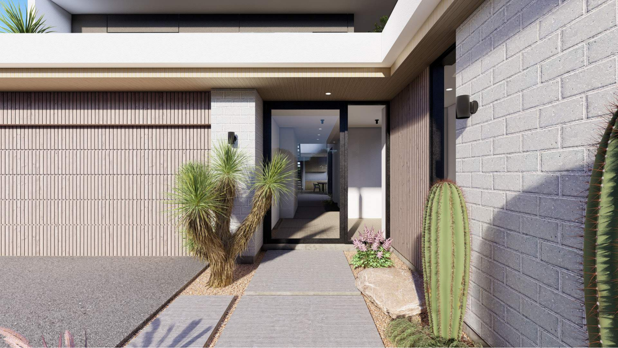
1830 - entry