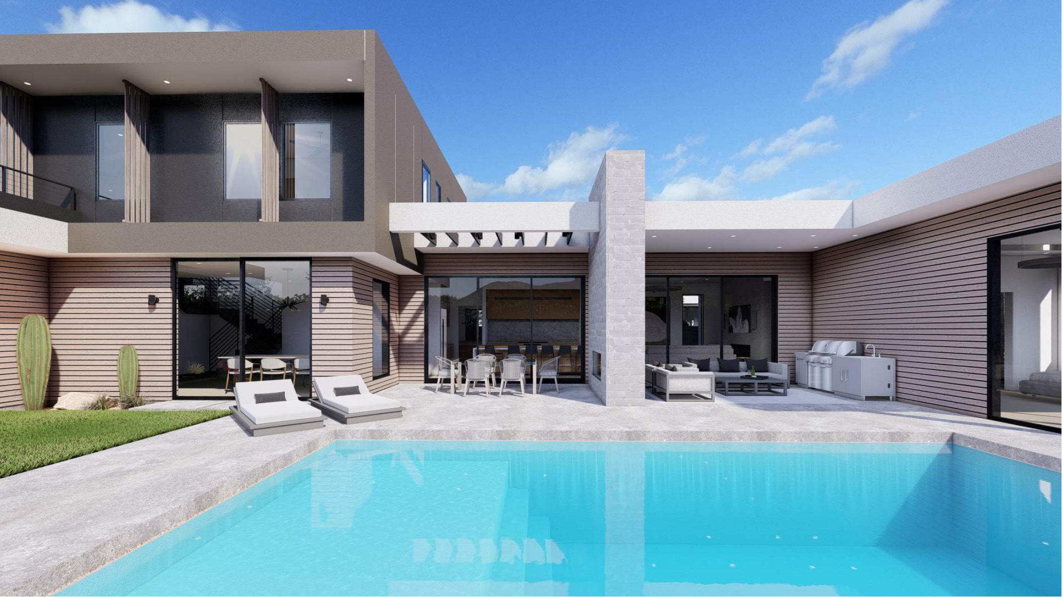
1832 - rear yard