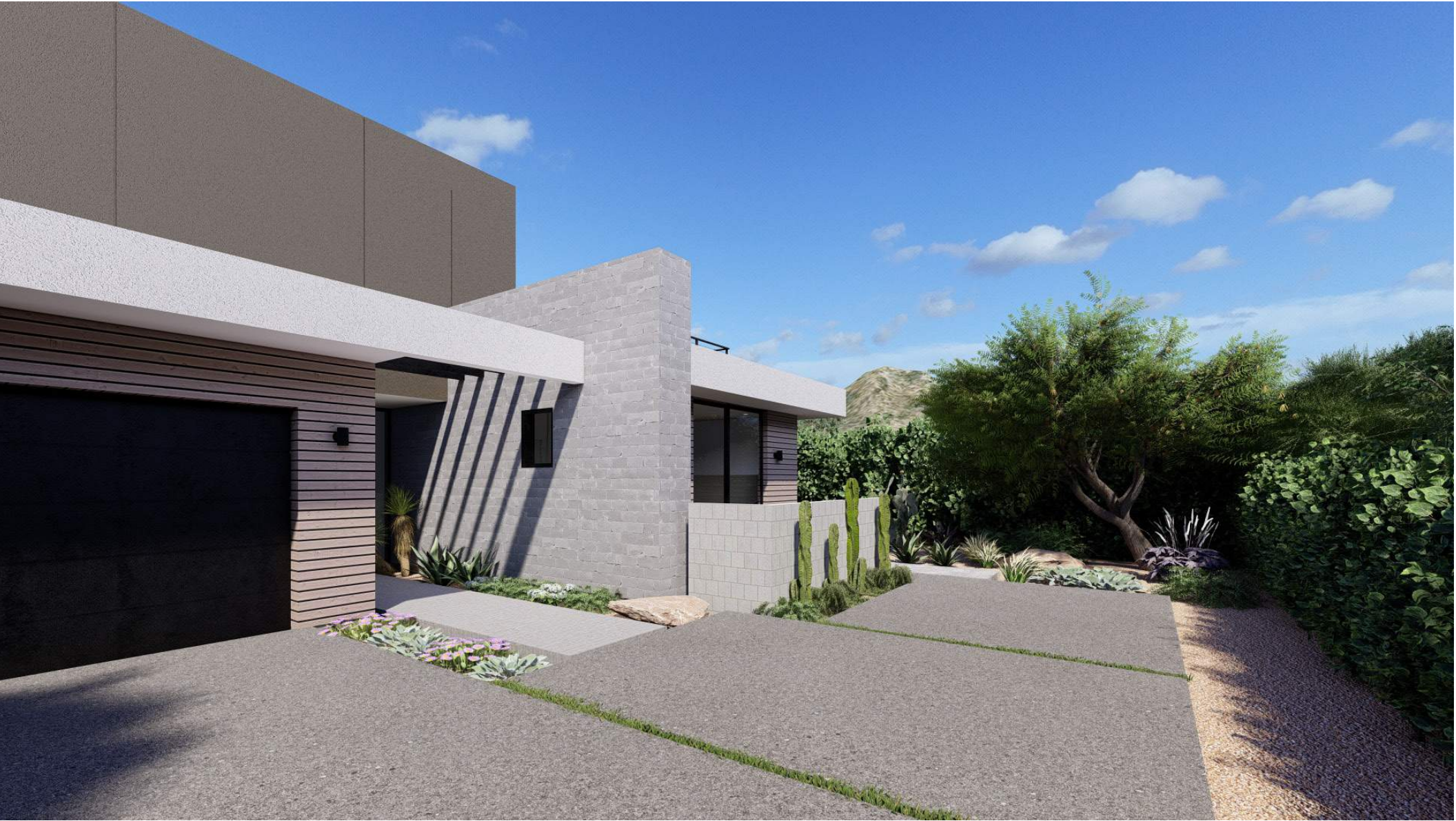
1832 - front motor court