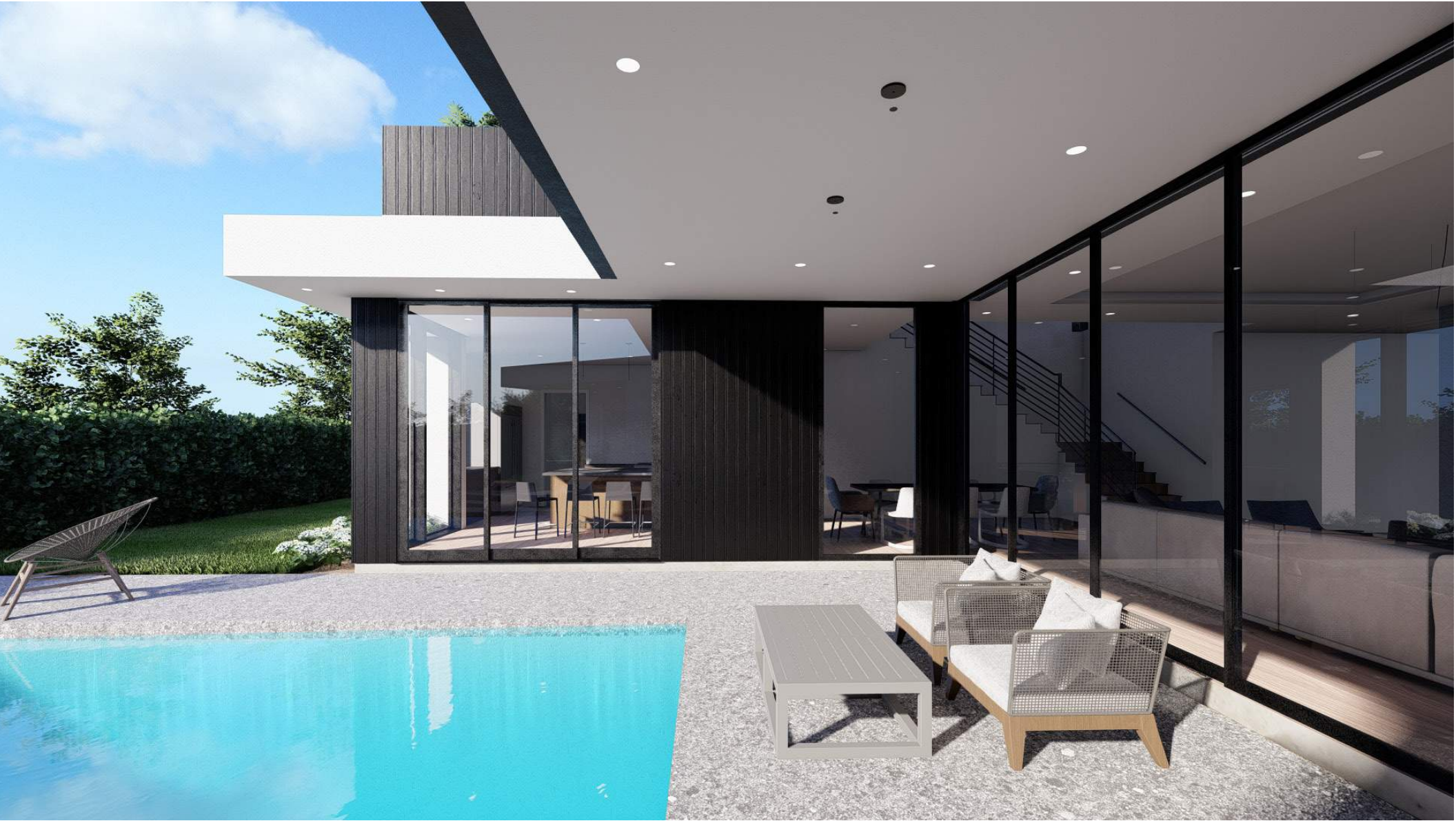
1827 - covered patio