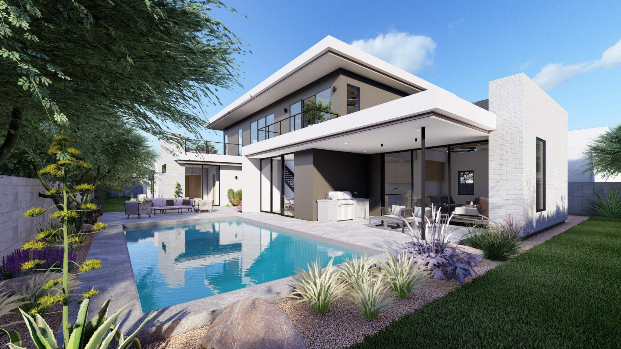
1830 - rear yard