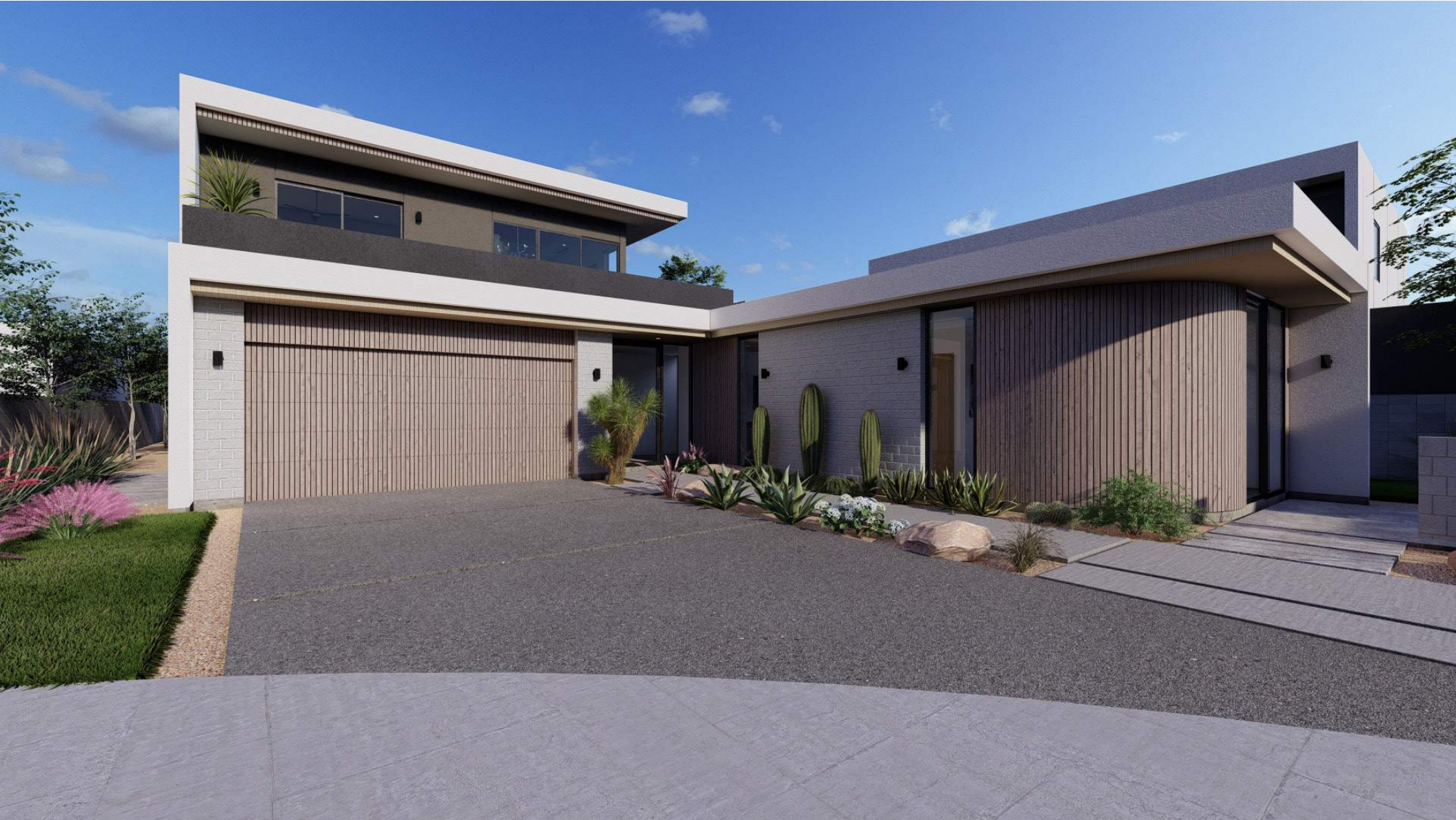
1830 - front