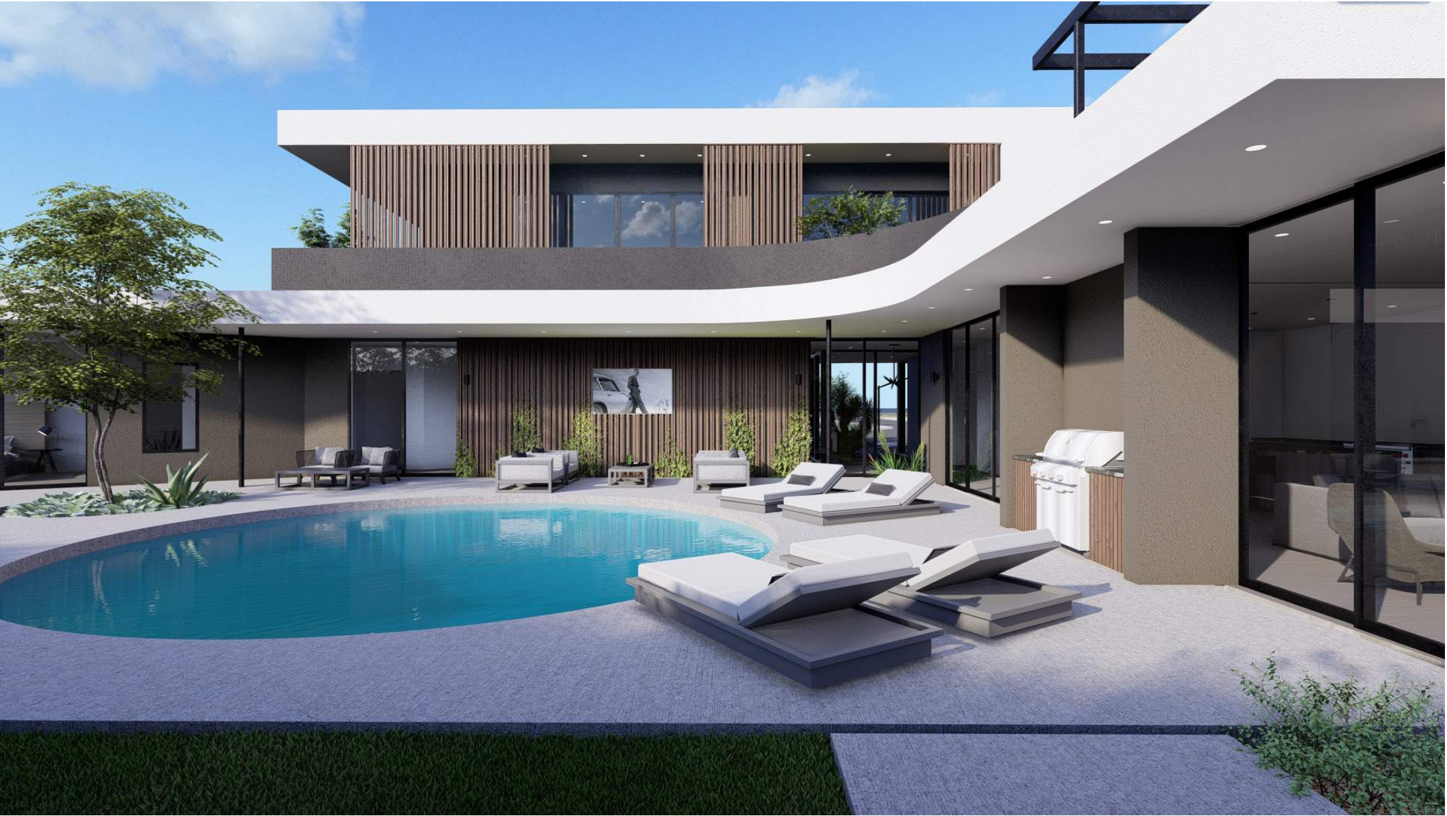
1831 - rear yard