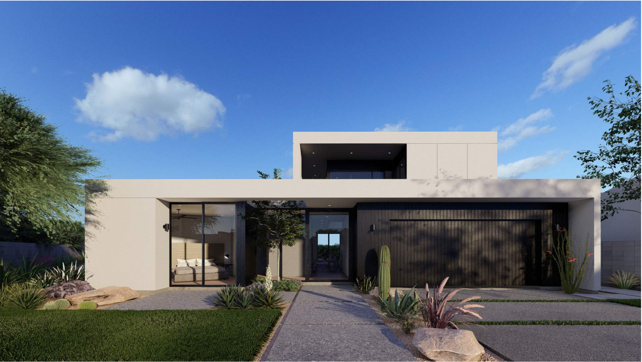
1827 - front elevation