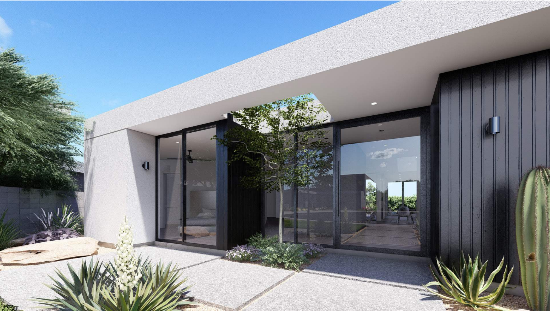
1827 - front yard