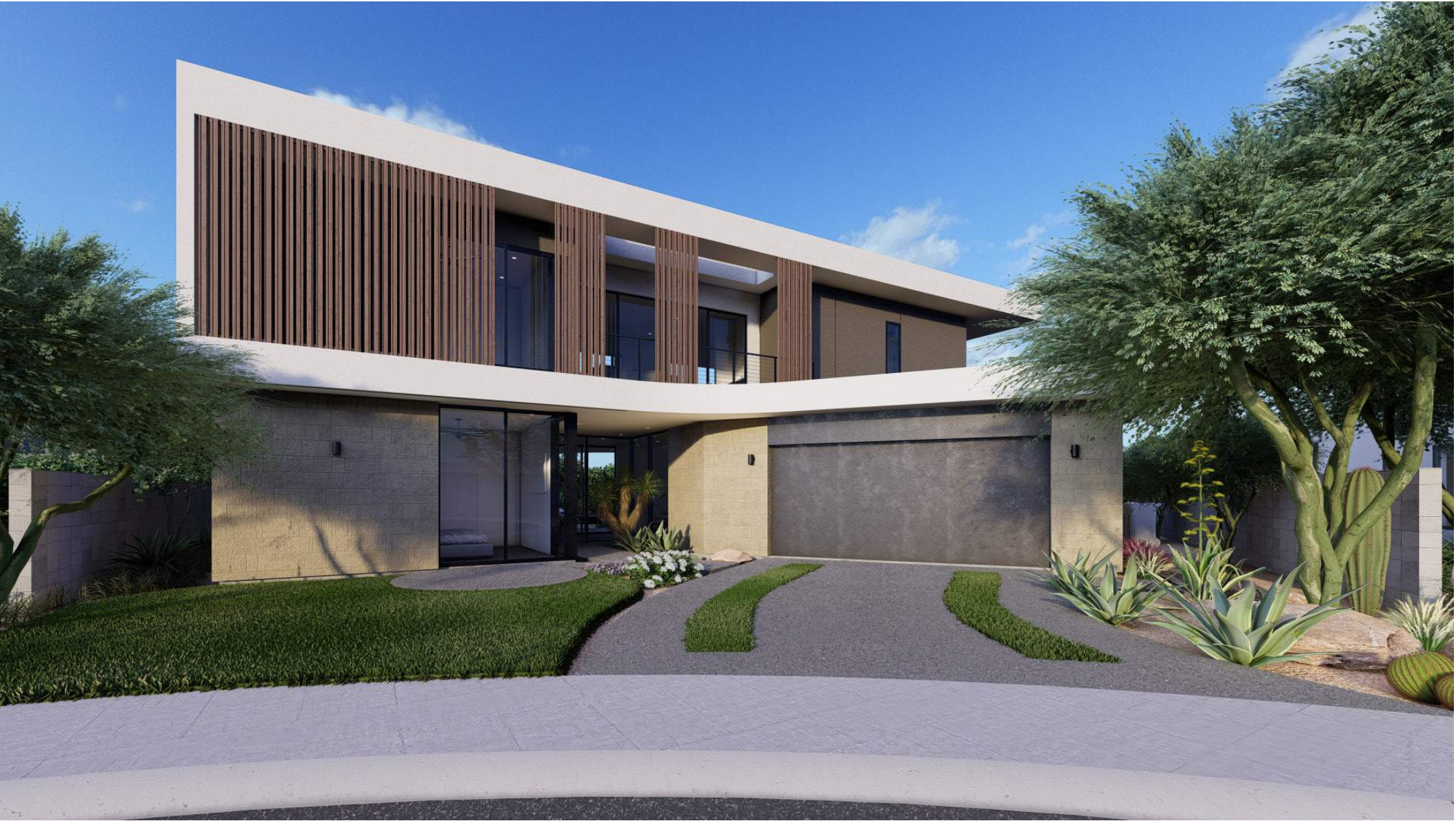
1831 - front elevation