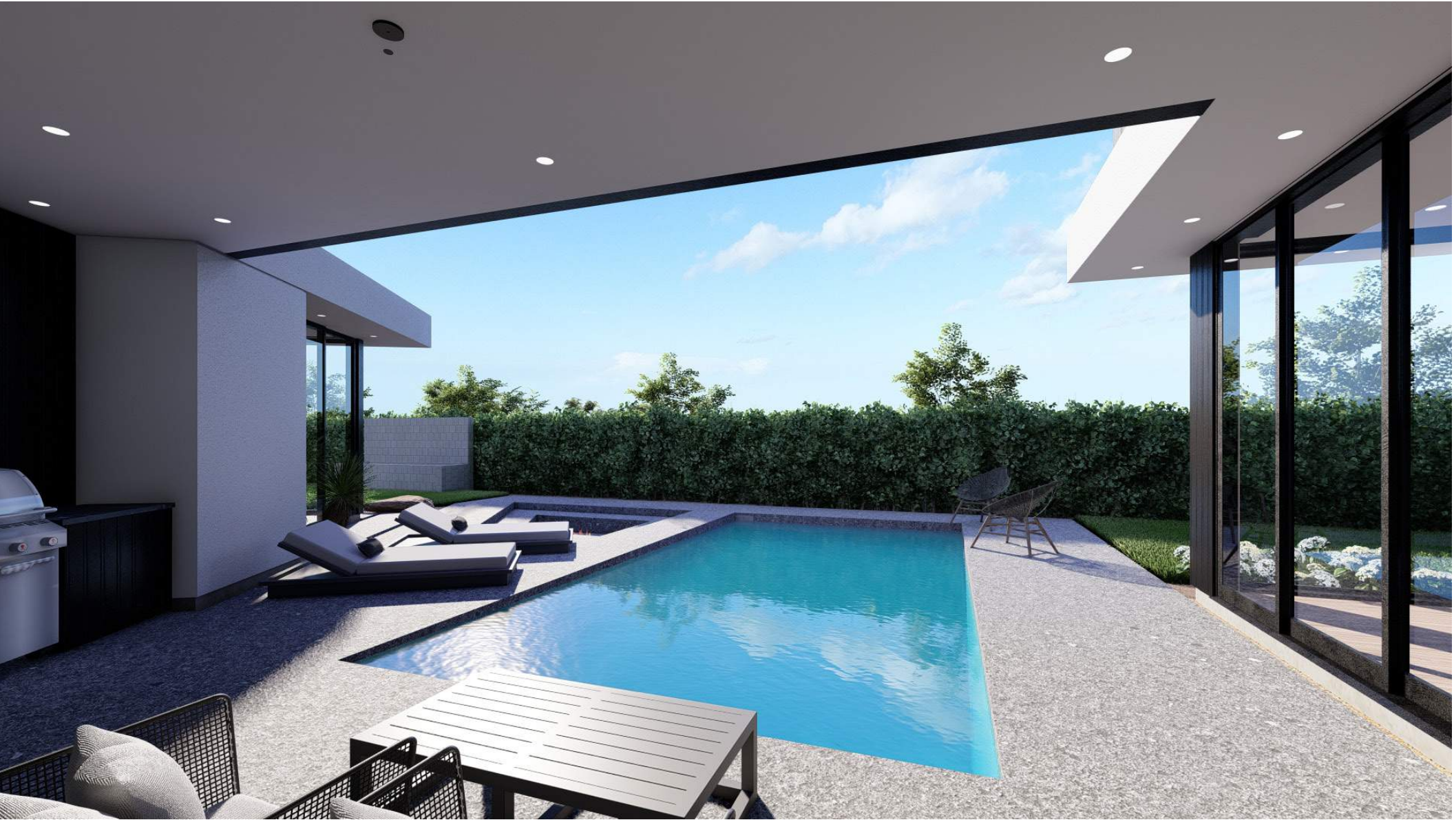
1827 - rear yard - south